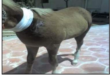
Fig. 4 Stallion (case 3) showed SC emphysema at the thorax, shoulder, legs and abdomen. Notice the wound at the base of the neck (arrow)

Table 1 Values of temp, pulse and respiratory rates in comparison to the reference range.