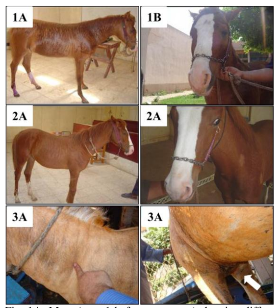
Fig. 1A: Mare (case 1 before treatment) showing diffuse subcutaneous emphysema. Notice the abduction of forelimbs and the stiff attitude. The head collar is pressed out by the swollen emphysematous skin at the head (arrow) (side view). Fig. 1B Same mare (case 1 before treatment) showing diffuse subcutaneous emphysema and swelling of the face (front view). Notice the bilateral mucopurrulent nasal discharge. Fig. 2A Mare (case 1) after treatment. The emphysema is obviously relieved at the head and neck regions (side view). Fig. 2B: The same mare (case 1) after treatment. The emphysema is obviously relieved at the head and neck regions (front view). Notice the area of skin incisions (arrows). Fig. 3A Stallion (case 2) showing generalized subcutaneous emphysema. The swelling is crepitant and pit under pressure at the neck region. Fig. 3B Stallion (case 2) showing penetrating wound at the axillary region (arrow) with evident SC emphysema at shoulder, thorax and abdomen

temperature and pulse rate were normal (Table 1).